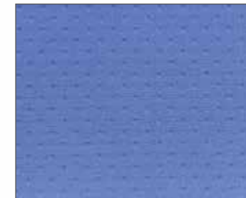
Aerofiber - 92% Polyester / 8% Spandex • Performance Open Hole Stretch Mesh • Moisture Wicking