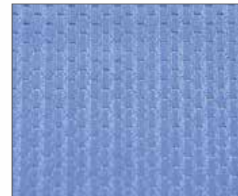
Rice Mesh - 100% Poly Pro Bright-Mesh • Performance Driven