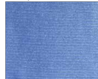
Heavy Dazzle - 100% Polyester • Strong and Durable