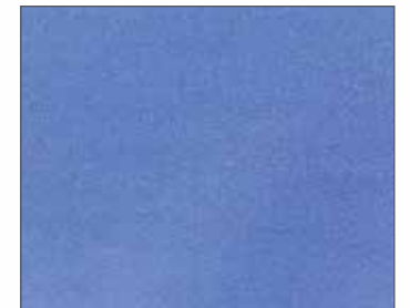
Poly-Flex™ - 90% Polyester / 10% Spandex • Abrasion strong